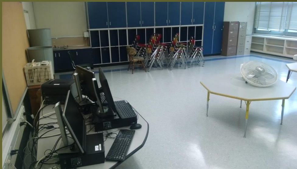
Flooring Replacements at Old Bethpage ES