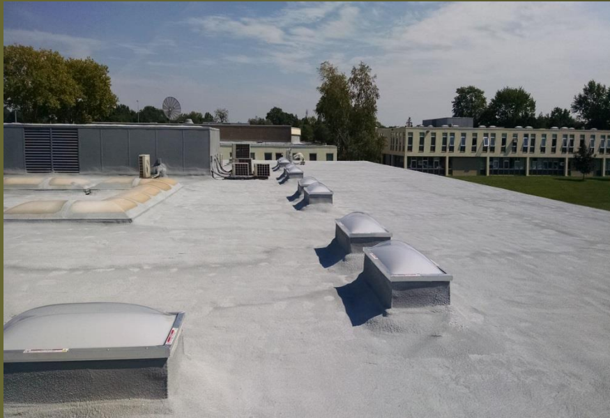
Improving Building Envelope